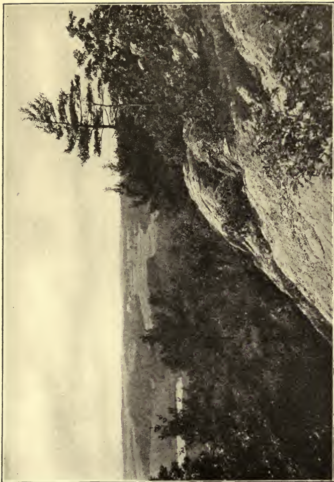
A BRIGHT HILLTOP IN THE BREEZY AIR